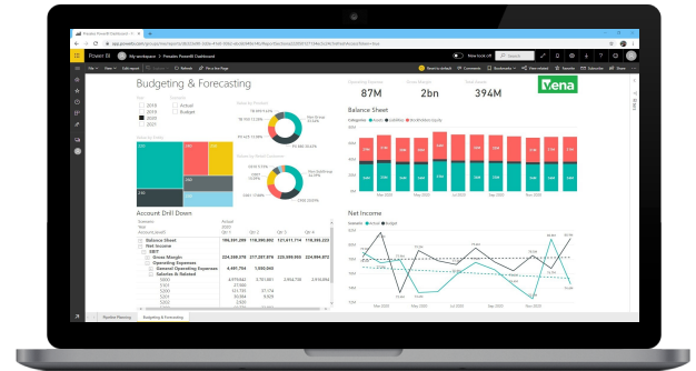
Self-serve, dashboard reporting with real-time performance data